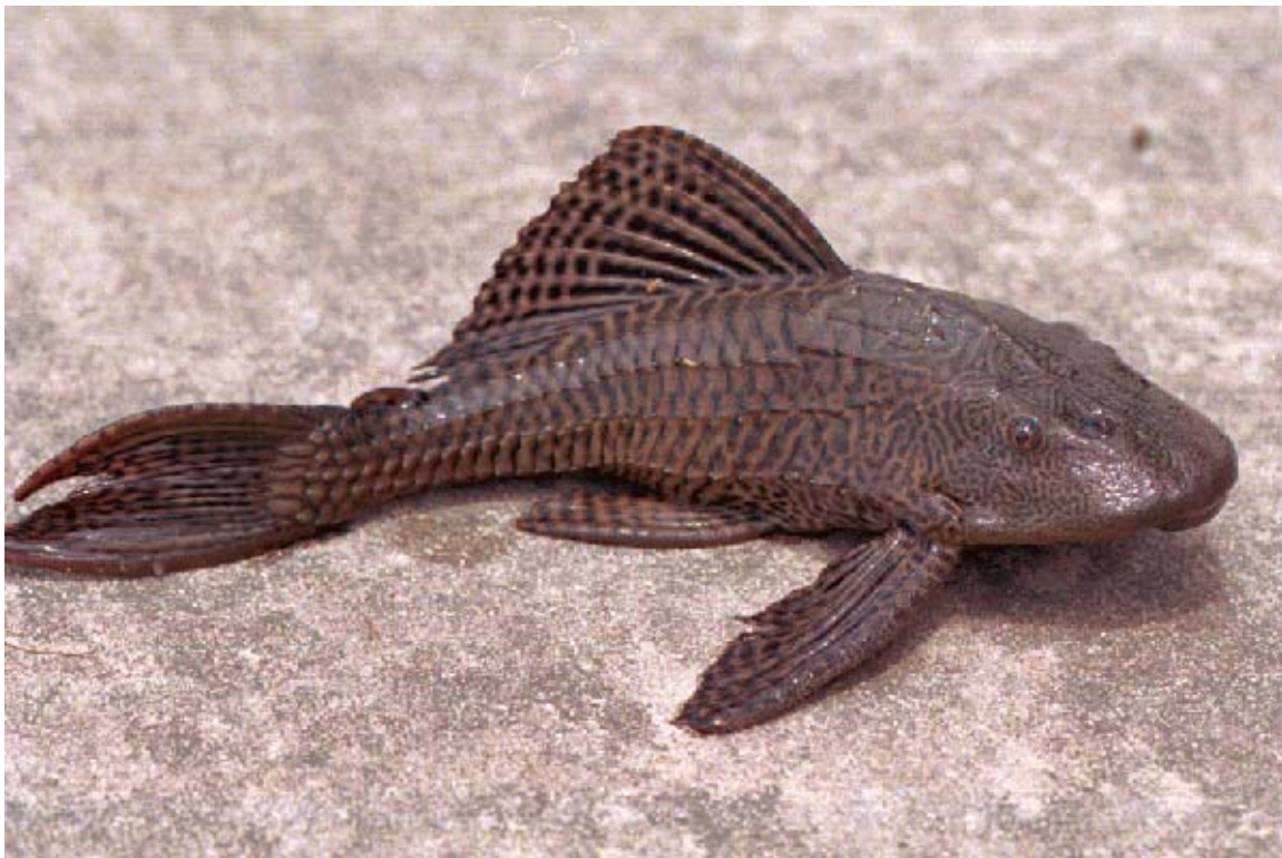
Sailfin catfish collected from San Antonio River May 2003

Suckermouth catfishes ( Loricariidae ), prevalent in the aquarium hobby for decades, are established and spreading throughout disturbed waters of the southern United States. Armadillo del rio ( Hypostomus spp. ) appear innocuous. Sailfin catfishes ( Pterygoplichthys spp. ), however, impact aquatic ecosystems at multiple levels. They disrupt food chains, compete with native herbivorous fishes, erode banks, and induce mortality of shorebirds. Body armor, large pectoral spines, extreme longevity, high fecundity, extraordinary parental care, anoxia- and desiccation-tolerance make these fishes formidable threats to native species and hamper traditional control techniques. Data from populations in the San Antonio River, Texas and in south Florida are used to suggest sampling protocols, priorities for future study, and management options.