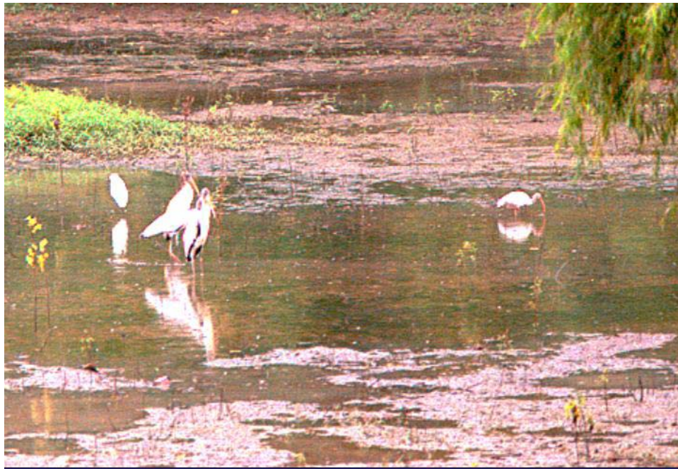
Wood storks and ibis feeding in floodplain pool at Tara.

Ninety percent of small floodplain pools once occurring in the lower Mississippi Basin have been eliminated by human activity. These distinctive wetlands are rarely studied and fish-habitat relationships infrequently described. In summer 2003, we surveyed pools on or near Tara Wildlife in Warren County, MS. Twenty-six species of fish were collected. Western mosquitofish, bluegill, and bantam sunfish were numerically dominant. In the two largest pools, three exotic species were collected: common, grass, and silver carps. Deeper pools were important feeding grounds for wood stork, harboring three times more species than shallower pools not visited by wood storks. Two pools of moderate size, connected temporarily with a large lake, and adjacent to extensive hardwoods, were inhabited by alligator gar. One pool contained a single individual, another more than 15 individuals. Injuries on gar indicate attacks by birds and conspecifics. Prior to the pool drying, alligator gar were removed, externally tagged and relocated to a nearby permanent slough. Three individuals were retained to monitor tag retention and test methods for effective radio-tag attachment. Our data indicate that floodplain pools (or borrow pits) can be created with minimal impacts from aquatic nuisance species and maximum benefits for imperiled fish and wildlife.