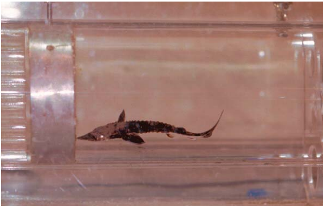
Juvenile lake sturgeon in laboratory swim tunnel.

Dredges can entrain sturgeon if current flowing into the dredge head exceeds swimming speed of the fish. Engineers are developing models for flow fields around dredge heads, but little information exists on swimming speeds of sturgeon. Using a laboratory swim tunnel, we determined swimming speeds for juvenile lake sturgeon ( Acipenser fulvescens ). Endurance (time-to-fatigue) and behavior (method of station-holding) were measured for 44 fish (114-195 mm TL) tested at water velocities of 45-85 cm/s. Velocities approximated upper limits of prolonged swimming speed and burst speed for fishes of comparable size. Most lake sturgeon swam 45-55 cm/s for 1-10 min (prolonged speed) and 65-85 cm/s for 6-30 s (burst speed). Decreasing endurance with increasing water speed was significant ( p < 0.05 ) but variability was high ( r^2 = 0.21 ), possibly due to variable nutritional states and sensitivity of fish to slight changes in water temperature. More than half of the fish tested used station-holding behaviors other than free-swimming in the water column (e.g., hunkering). Results were comparable to those for juvenile lake sturgeon in Canada and higher than those for pallid sturgeon. Differences in swimming performance between populations of sturgeon are much smaller than those between species having different body shapes.